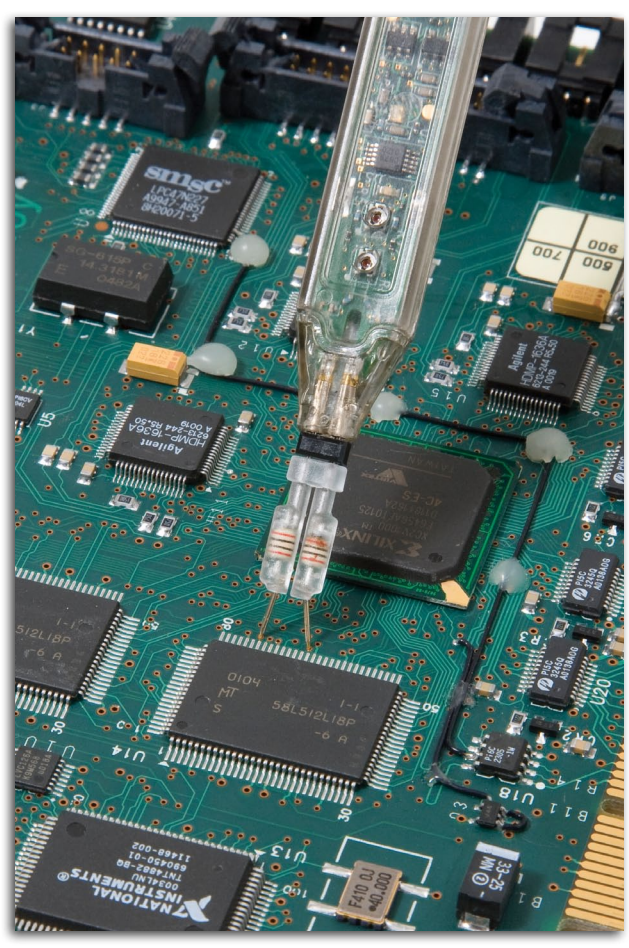
The Swivel Tip adapter can be adjusted to probe test points ranging from 0 to .300" apart with Z-Axis compliance.