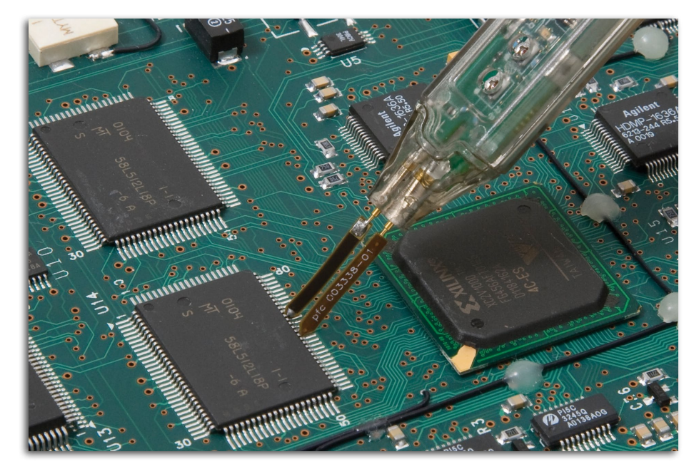
The IC leads with a compensation resistor provide excellent signal fidelity when probing pins of an IC. One side of each blade is insulated to prevent shorting the signal to the adjacent pin.