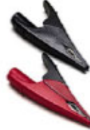
AC285-FL: Alligator Clips.