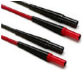
196-3523-00: Extender Leads (1.5 m).