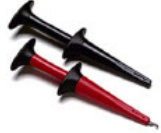
AC280-FL: Hook Clips.