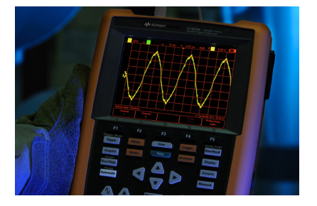
Figure 3. Night vision mode for performing tasks in a poorly lit environment