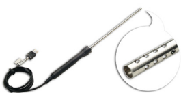
U1183A Air Temperature Probe