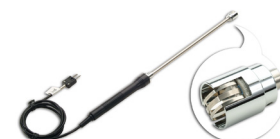
U1182A Industrial Surface Temperature Probe