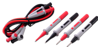
U1169A Test Probe Leads

Includes two test leads (red and black), and a pair each of 19-mm and 4-mm test probes.