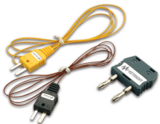
U1180A Thermocouple Adapter+Lead Kit, J and K Types

Includes thermocouple adapter, thermocouple bead J-type and thermocouple bead K-type.