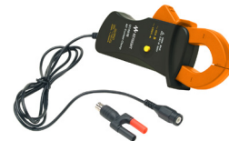
U1583B AC Current Clamp