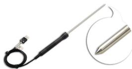
U1181A Immersion Temperature Probe