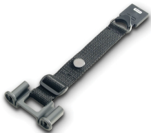
U1171A Magnetic Hanging Kit

For fastening of DMM to a steel surface so both hands are free.