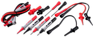
U1168A Standard Test Lead Kit

Includes two test leads (red and black), 19-mm and 4-mm test probes, alligator clips, fine-tip test probes, SMT grabbers and mini grabber (black).