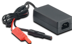
U1170A AC Adaptor