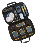
Both multimode and singlemode sources are available in the FTK1450 Complete Verification Kit