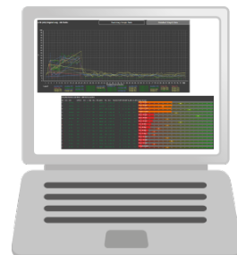
Downloaded HTML Survey Results