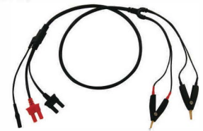
GTL-308 Test lead