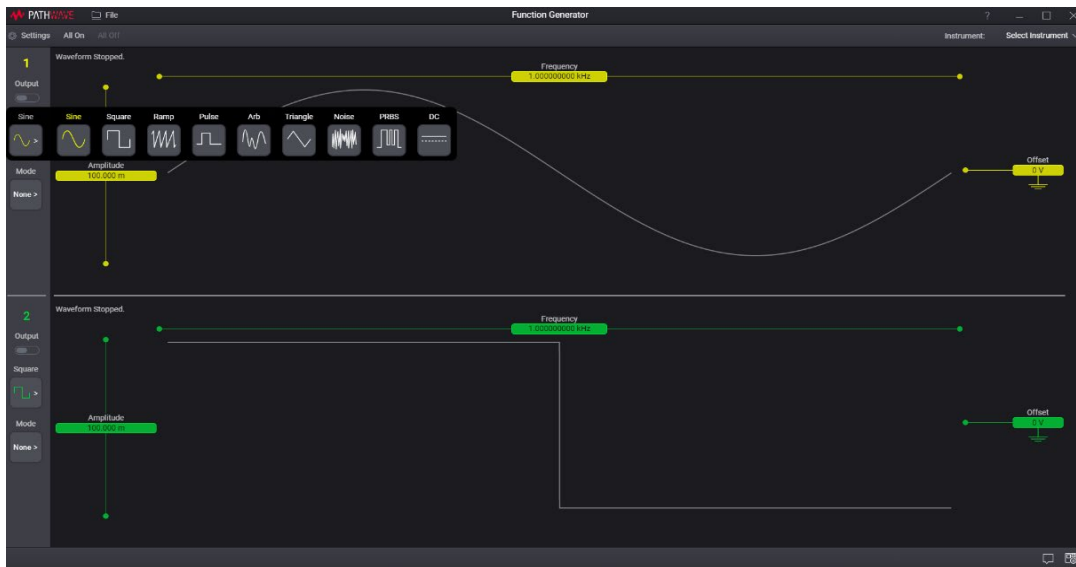
Figure 5. Select and configure your required waveform