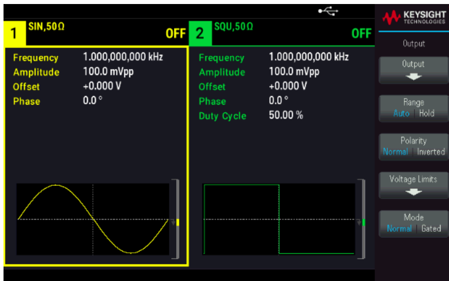
Figure 2. Dual-screen display of standard sine and square wave