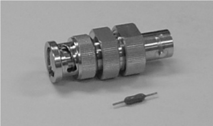
BNC Fuse Adapter and 0.125 A Fuse