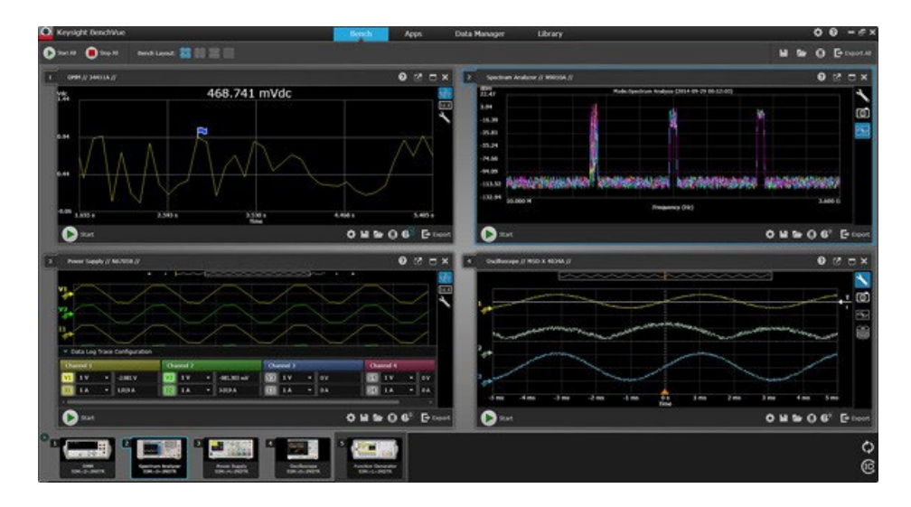
Figure 1. See your measurements across instruments in one place to quickly correlate measurement activities and obtain actionable insights.

With the companion BenchVue Mobile app, monitor and respond to long-running tests from anywhere. Download BenchVue software at no cost today <a href="https://www.keysight.com/find/benchvue">www.keysight.com/find/benchvue</a>